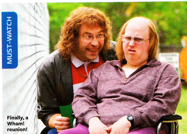
Finally, a Wham! reunion!

Premieres: October 13, NBC Christian Slater plays a suburban family man with a gorgeous wife, a couple of kids, and a secret—he shares his body with Edward Albright, a lethal killing machine, in this Dr. Jekyll and Mr. Hyde rehash. Our take: We loved Slater as a villain in Heathers , but will the first person he murders please be whoever's responsible for every movie he's done since Very Bad Things ?